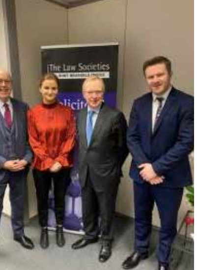
LSNI attend annual reception in Brussels

embers of the Law Society of Northern Ireland's Presidential team, Council members and staff officers attended the Four Jurisdictions Family Law Conference in Malaga from Friday 31 January 2020 – Sunday 2nd February 2020. The overall theme of the conference was '25 years of Family Law'. The programme included sessions on the thorny issues facing practitioners involved in child law and financial remedies, led by internationally renowned judges and practitioners from across the various jurisdictions."