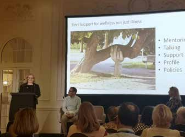
LSNI Four Jurisdictions Conference