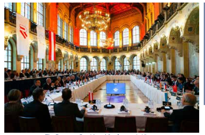
The European Presidents' Conference in Vienna

he European Presidents' Conference, organised by the Austrian Bar (ÖRAK), has developed over decades into an important forum for dialogue. During the time of the so-called iron curtain this was very often the only possibility for contacts and exchange between lawyers from both sides. Nowadays the European Presidents' Conference is the most important meeting of the presidents of the bars and bar associations of the EU member states and neighbouring countries.