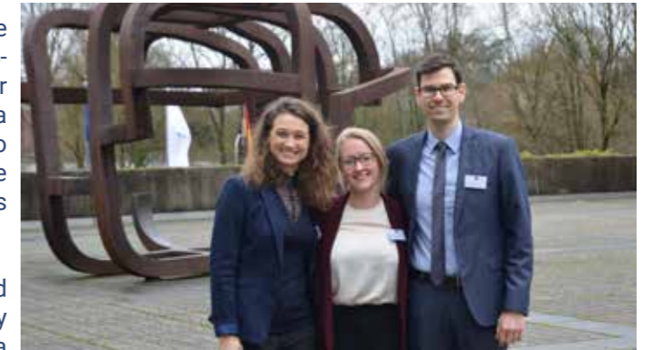
The winning team

31 contestants from 17 countries have been selected and grouped into teams of mixed nationalities. They were asked to submit their written reports followed by a negotiating exercise on company law, and a moot court exercise on criminal law.