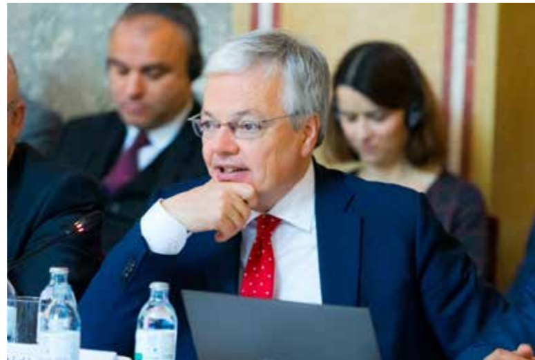
Didier Reynders