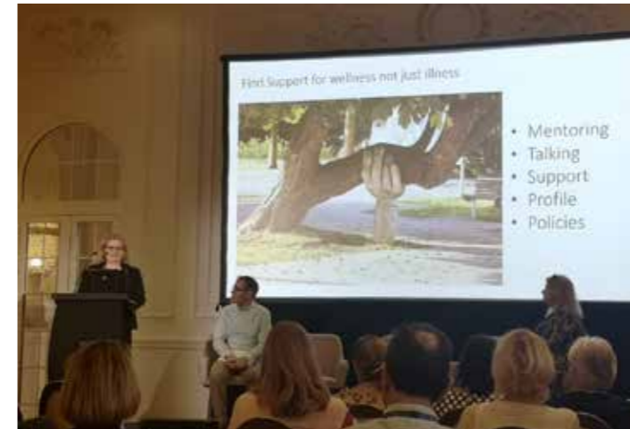
LSNI Four Jurisdictions Conference

Members of the Law Society of Northern Ireland's Presidential team, Council members and staff officers attended the Four Jurisdictions Family Law Conference in Malaga from Friday 31 January 2020 – Sunday 2nd February 2020. The overall theme of the conference was '25 years of Family Law'. The programme included sessions on the thorny issues facing practitioners involved in child law and financial remedies, led by internationally renowned judges and practitioners from across the various jurisdictions."