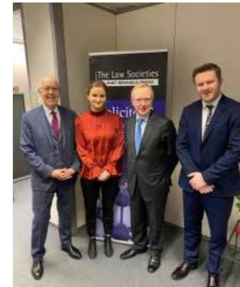
LSNI attend annual reception in Brussels