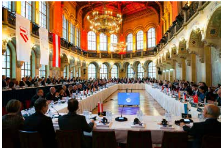
The European Presidents' Conference in Vienna

T he European Presidents' Conference, organised by the Austrian Bar (ÖRAK), has developed over decades into an important forum for dialogue. During the time of the so-called iron curtain this was very often the only possibility for contacts and exchange between lawyers from both sides. Nowadays the European Presidents' Conference is the most important meeting of the presidents of the bars and bar associations of the EU member states and neighbouring countries.